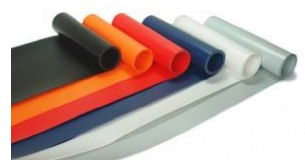
2. PVC:- used in most production manufactured boats.